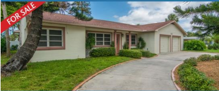
323 81st Avenue 4 BR | 2 BA | 1,854 SF Listed at $389,000

Recognized as one of the "10 Best" in customer satisfaction! Debbie & her Team look forward to working with you!