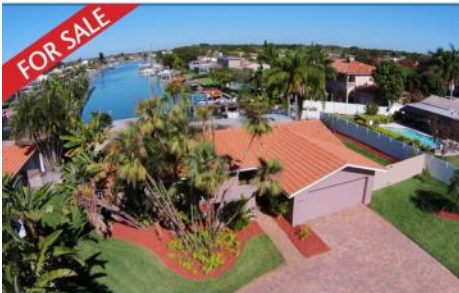
4419 46th Avenue S 3 BR | 3 BA | 1,956 SF Listed at $659,000