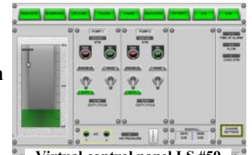
Virtual control panel LS #59

maintenance issues. According to Ken, one of the most troublesome problems are personal wipes originally used for babies but that now increasingly are used by adults as well and then flushed down the toilet. Disposable wipes should not be flushed but put in a plastic bag for regular trash/garbage pickup. We all need to be aware and show an interest in what happens after everything goes down the drain.