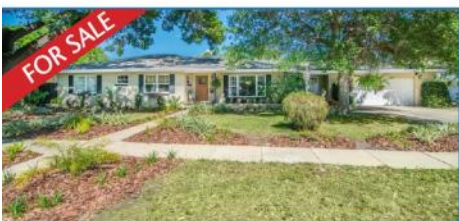
631 29th Street N | Historic Kenwood 3 BR | 3 BA | 1,976 SF Listed at $530,000