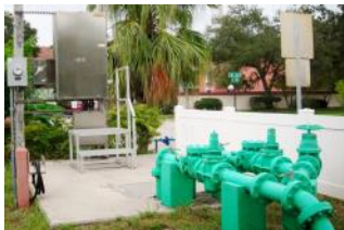
Broadwater Lift Station #59

Lift stations and process equipment at the SW facility are adversely affected by sewage materials that cause frequent