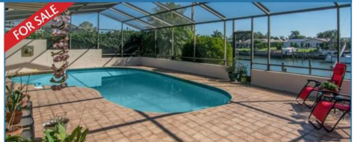
4400 45th Street S 4 BR | 3 BA | 3,238 SF Listed at $849,000