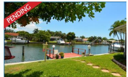
3900 46th Avenue S 3 BR | 3 BA | 2,00 SF Last Listed at $599,000