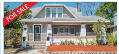
2645 2nd Avenue N | Historic Kenwood 3 BR | 2 BA | 1,827 SF Listed at $425,000