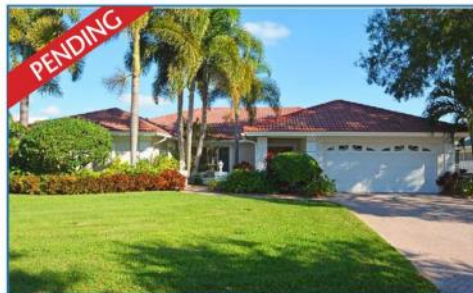
4360 39th Street S 3 BR | 2 BA | 2,489 SF Last Listed at $747,000